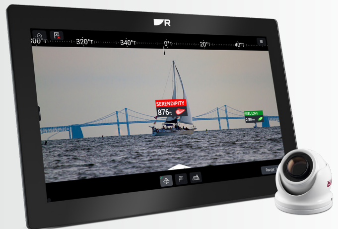
Augmented Reality with CAM300 and AR200 sensor